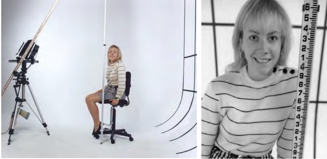
Example 4 illustrates the hinge rule under quite different circumstances. 30° of back tilt combined with 26° of lens tilt (4° relative to the back) put the hinge line 7 feet from the lens and about 6 feet directly over the subject's head. Focusing with the camera back now causes the plane of sharpest focus to swing from the hinge line like a pendulum. The result is distorted, but in focus.

variety of common lens focal lengths from 53 mm to 450 mm. I'll warn you, the book is very technical. But if you've understood this article, all you really need for now is that card.